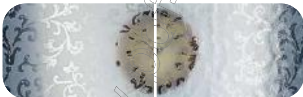
Pilkington Oriel Brocade ™

With a superb range of designs, together with diffused glass options for each design, this premium range of etched glass adds a touch of style and elegance to your home.