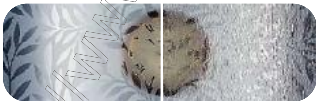
Pilkington Oriel Laurel ™