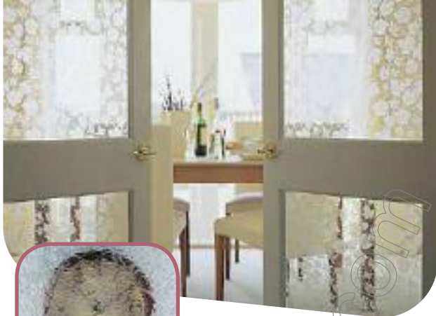
Pilkington Oriel Coppice ™