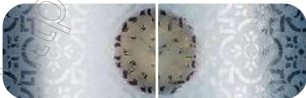
Pilkington Oriel Canterbury ™