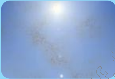
2. Daylight triggers the Pilkington Activ ™ coating.