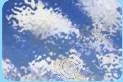
4. Rainwater hits window and sheets down glass.