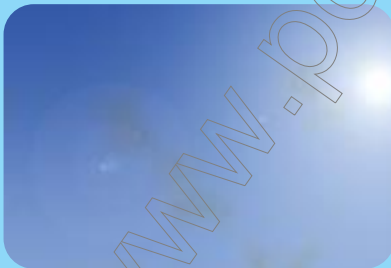
3. Reaction loosens organic dirt.