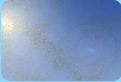
1. The window is exposed to daylight.