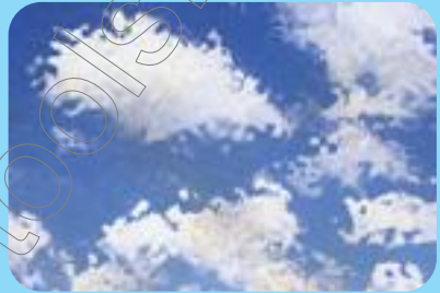
5. Dirt is washed away by rain.