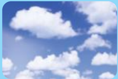
6. Window is left clean.